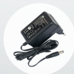
24V 1.2A Adapter